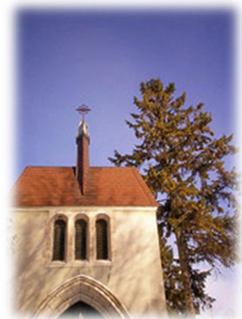
Summerlea United Church (Lachine, QC)