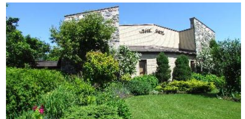
Église chrétienne évangélique (St-Eustache, QC)