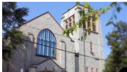
Saint Andrew's United Church (Halifax, NS)