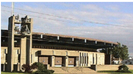
Ste-Marguerite-Bourgeoys (Longueuil, QC)